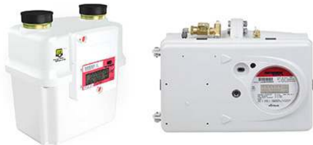
Figure 3. The Sensus Sonix IQ ultrasonic meter for residential class use (250 and 400 CFH), weighs about 6 lb.

stiffen, shrink or change shape with changing temperatures, accelerating wear and tear. The solid-state construction of ultrasonic gas meters means greater resistance to freezing