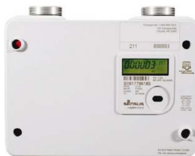
Figure 1: The Sensus Sonix IQ ultrasonic meter for residential class use (250 and 400 CFH), weights about 6 lb.

The ultrasonic gas meter is now poised to be a game-changer in residential gas metering. Future-forward gas utilities that adopt this technology can leverage its advantages to increase process efficiencies and hone a competitive advantage in the smart gas landscape.